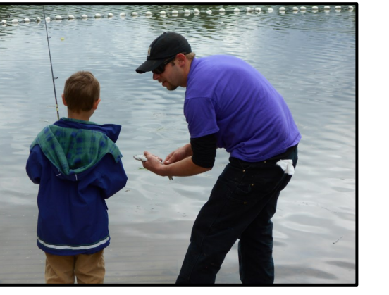
It is about 1 mile around the lake so wear appropriate shoes for walking.

Watch the weather! Be prepared with sunblock or umbrellas :-)