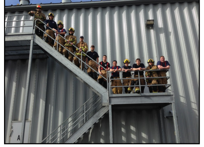
Cadets and helpers at MERTS in Astoria, OR

Call us to learn about becoming a volunteer 673-2222. Must be 18 or older (or enrolled in Fire Science) and live within the District #5 response area.